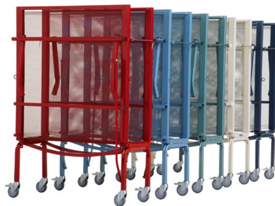
Award Winning GLIDEAWAY ® Visitor Guestbed Frames