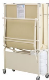
The 2ft.6ins. XH 'GLIDEAWAY'® Visitor Guestbed with Ivory (colour 4) bed frame, folded up. Note the integral Bedding Tray.