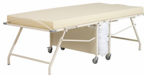
The 2ft.6ins. XH 'GLIDEAWAY'® Visitor Guestbed with Ivory (colour 4) bed frame, open. Note the integral Bedding Tray.

The extra high XH 'GLIDEAWAY'® (Sleeping height 67.5cm when deployed) was originally developed for the Marie Curie Hospice group, to accommodate patients' partners, family members, friends, or carers overnight. The idea is to enable patient and visitor to sleep in close proximity and at the same height. This model additionally incorporates a handy Bedding Tray.