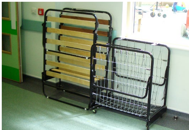
Two Typical Guest Bed Frames.

Look at the two pictures below. You don't need to be an expert to instantly see that the 'GLIDEAWAY'® bed frames are not just superior, but VASTLY superior to the others, in every way - we are literally talking 'chalk and cheese' here!