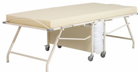
The 2ft.6ins. XH 'GLIDEAWAY'® Visitor Guestbed with Ivory (colour 4) bed frame, open. Note the integral Bedding Tray.

The XH 'GLIDEAWAY'® was originally developed for the Marie Curie Hospice group, to accommodate patients' partners, family members, friends, or carers overnight. The idea is to enable patient and visitor to sleep in close proximity and at the same height. This model additionally incorporates a useful Bedding Tray.