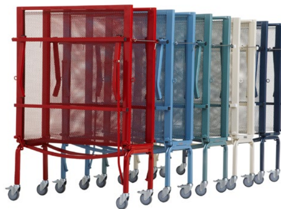
Award Winning GLIDEAWAY ® Visitor Guestbed Frames