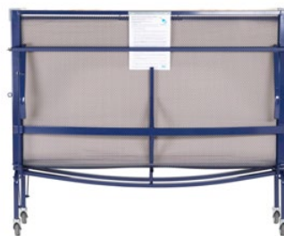
A 4ft.6ins. double 'GLIDEAWAY'® Visitor Guestbed with Dark Blue (colour 14) bed frame, folded up.

The 'GLIDEAWAY'® Visitor Guestbed is now available in 2 standard double sizes, which are much stronger, easier to handle and less bulky than other double heavy-duty guest beds and will cope with loads of up to 400Kg.