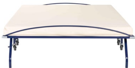
A 4ft.6ins. double 'GLIDEAWAY'® Visitor Guestbed with Dark Blue (colour 14) bed frame, open.